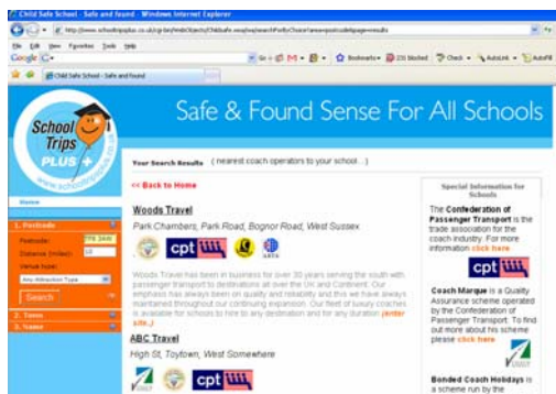
Schools will be able to search for coach operators and view accreditations and other relevant information

By far the most significant benefit of this new service is the ability for schools to be able to check the suitability of coach operators. Through www.schooltrips.co.uk schools will have access, for the first time, to view coach operators' accreditations, services and credentials in one place – ensuring they are choosing a coach operator that provides a service high on quality and safety.